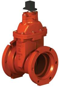
Mechanical Joint x Mechanical Joint