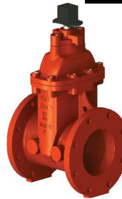
Tapping Valves w/Flg. Side Acc.