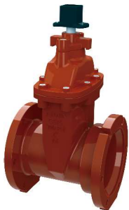
Flange x Mechanical Joint